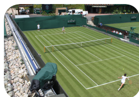
with ACS SMARthead™