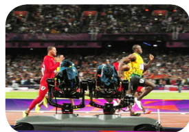
Dual head track