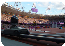
with HD Cineflex V14

Where smaller railcam footprints are required, the MG2 and NTS track (pictured above), combined with our ACS SMARthead™ remote head system provides the perfect solution. Available in sections of 2.4m up to 30m in length, the system is quick to rig and ideal for events where space and audience sight lines are at a premium.